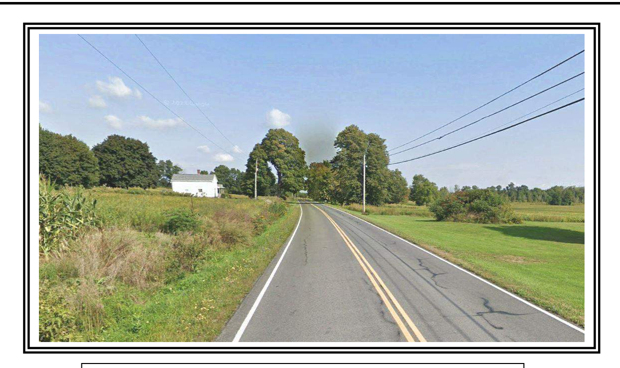
Entrance #10 – CR 108 Looking Left