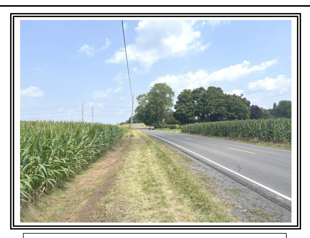
Entrance #4 - CR 108 Looking Left