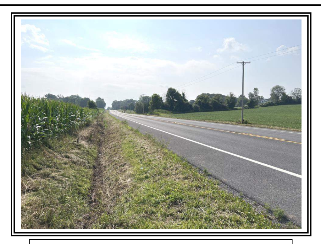
Entrance #9 – SR 96 Looking Left