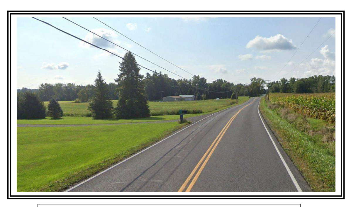
Entrance #10 – CR 108 Looking Right