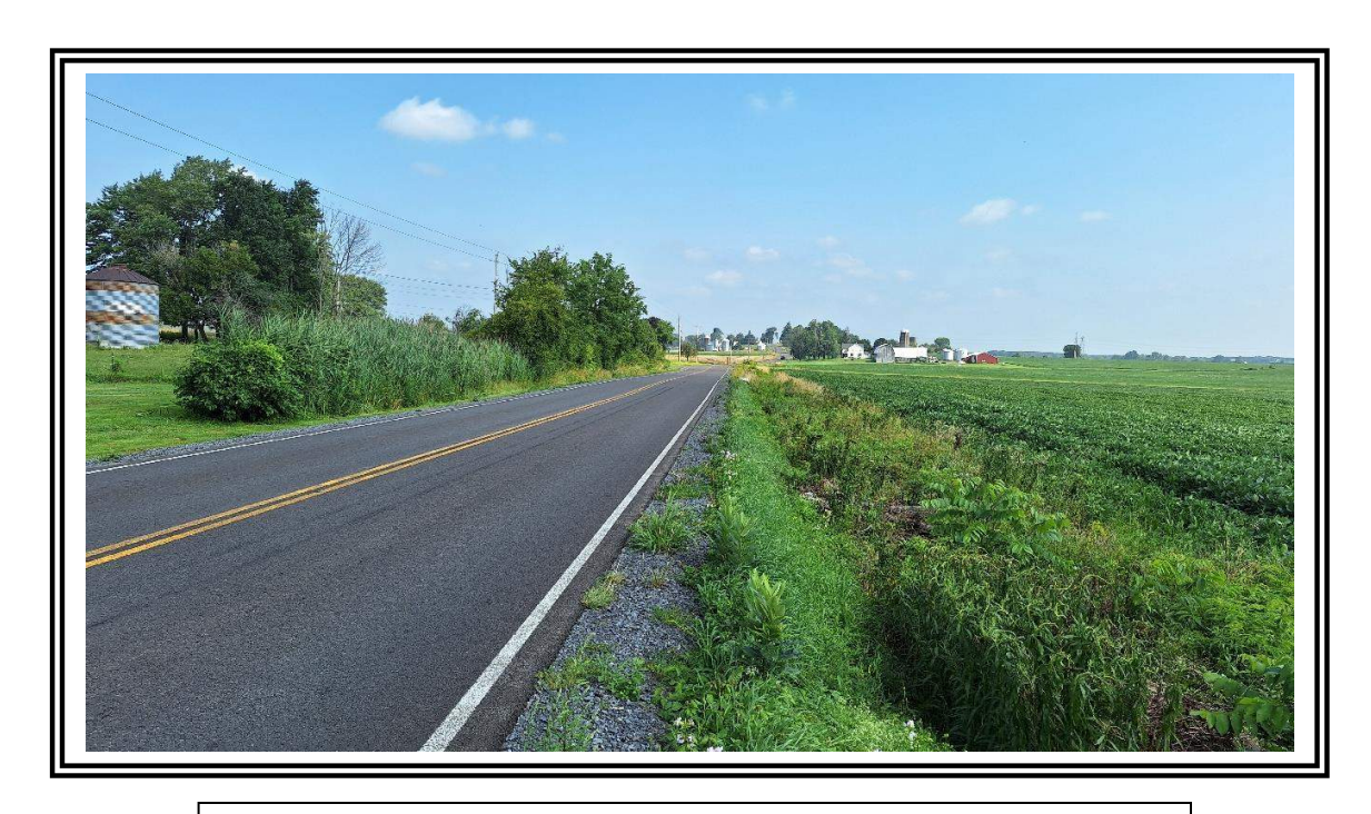
Entrance #5/6 – CR 107 Looking Right