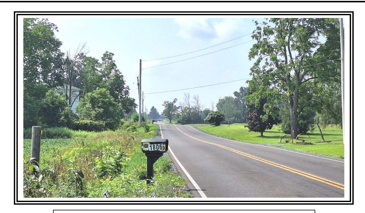
Entrance #5/6 – CR 107 Looking Left