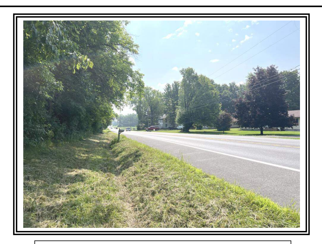
Entrance #11 – SR 96 Looking Left