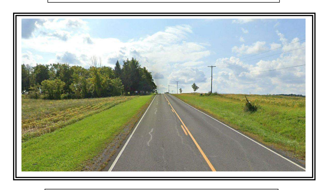
Entrance #1 – CR 108 Looking Right