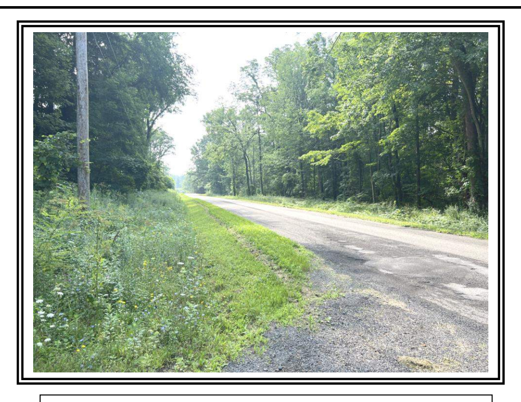
Entrance #3 – Dunham Rd Looking Left