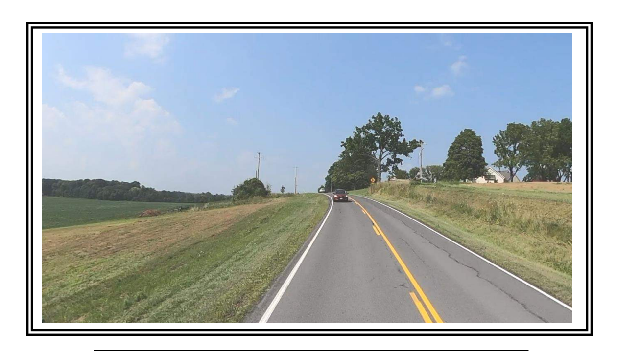
Entrance #2 – CR 108 Looking Left