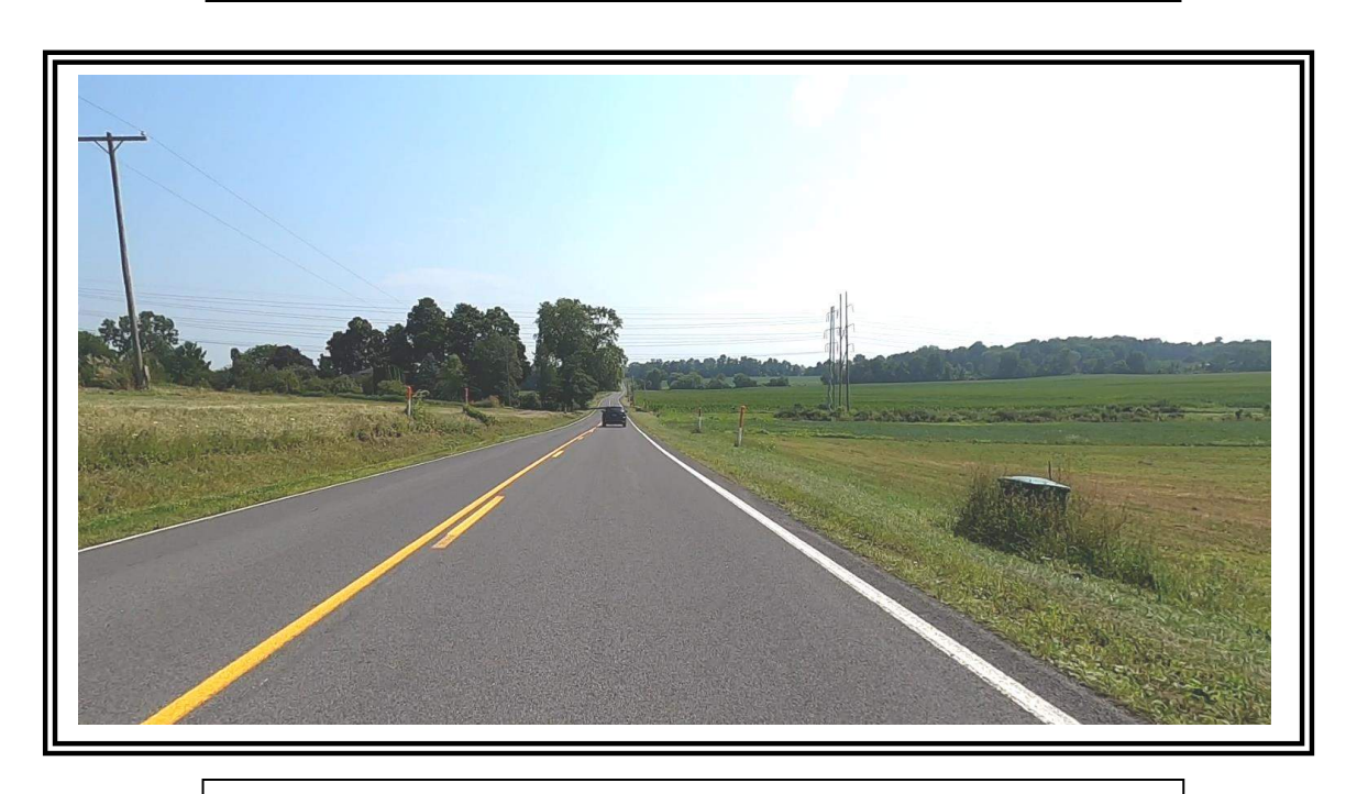
Entrance #2 – CR 108 Looking Right