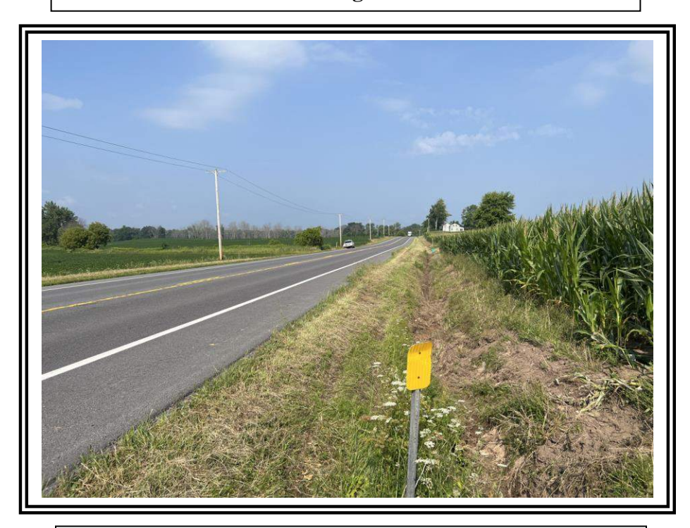
Entrance #9 – SR 96 Looking Right