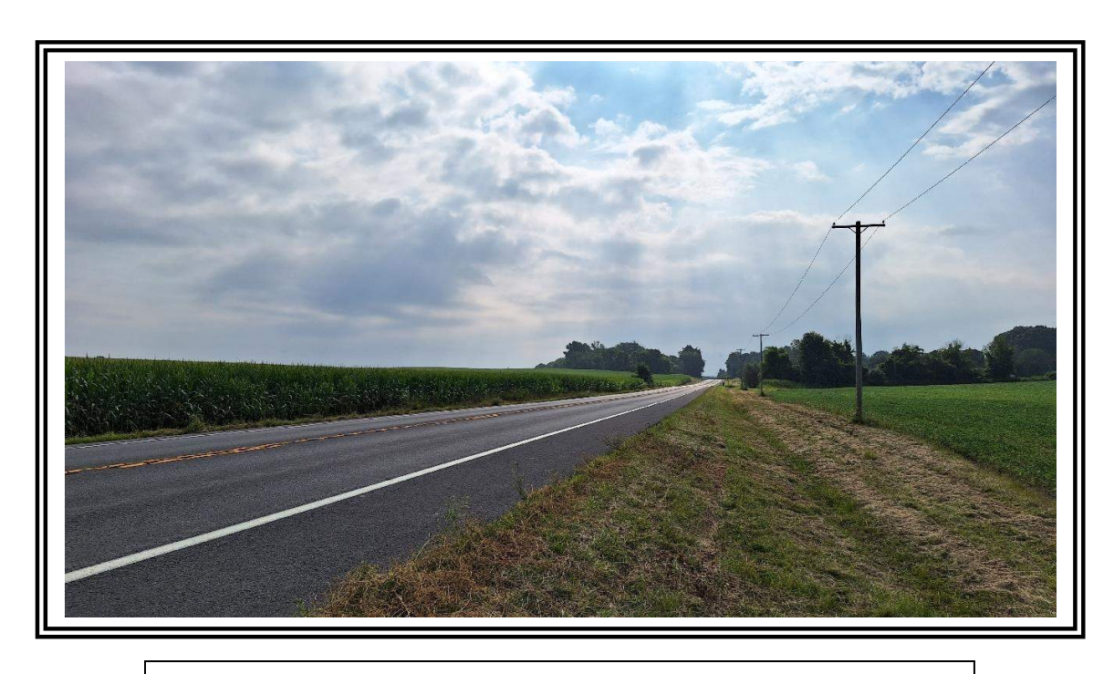
Entrance #12 – SR 96 Looking Right