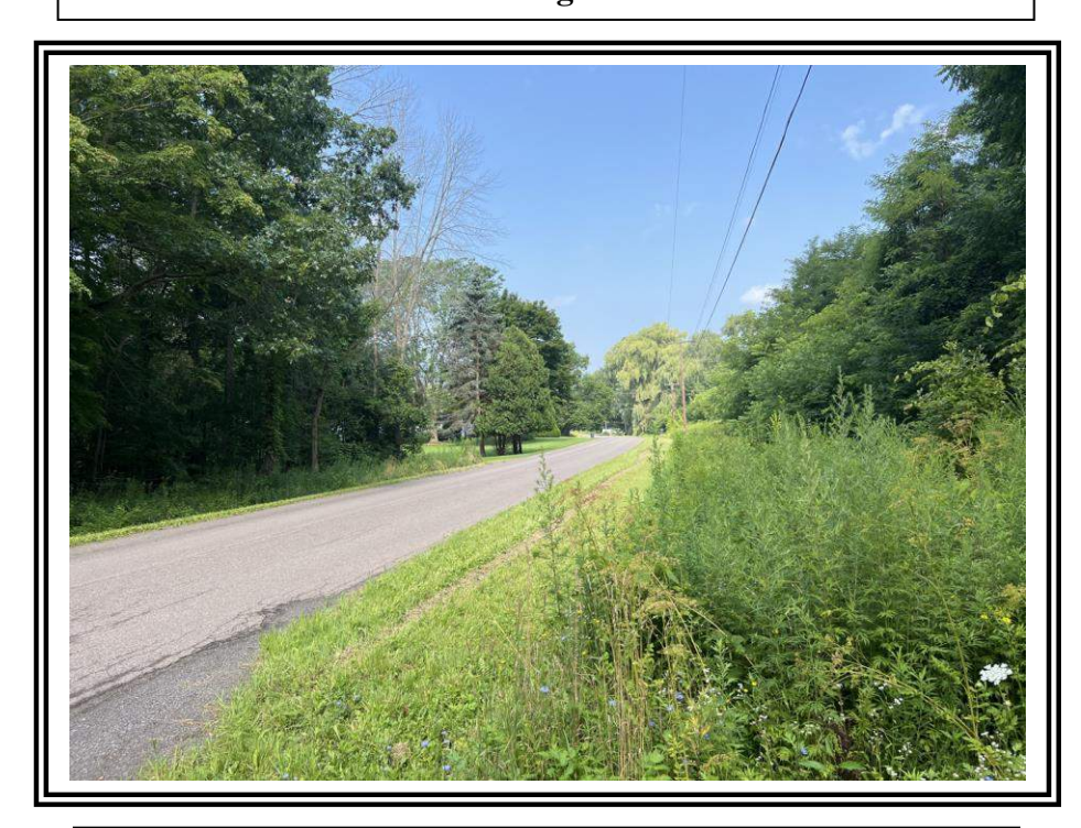
Entrance #3 – Dunham Rd Looking Right