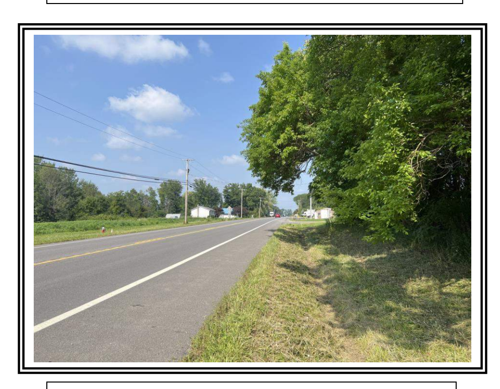
Entrance #11 – SR 96 Looking Right