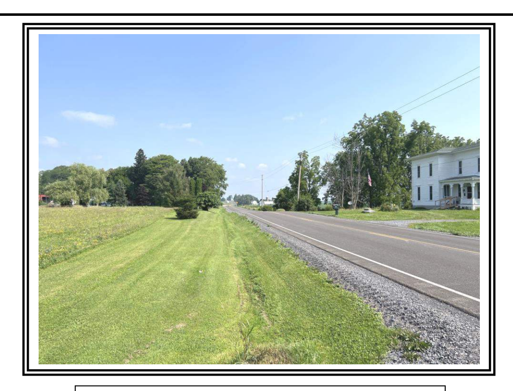
Entrance #8 – CR 107 Looking Left