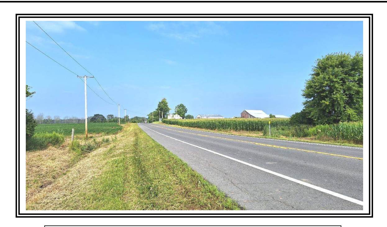
Entrance #12 – SR 96 Looking Left