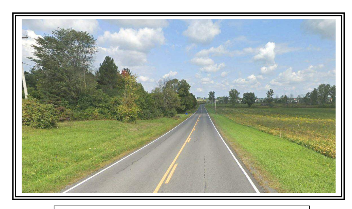
Entrance #1 - CR 108 Looking Left