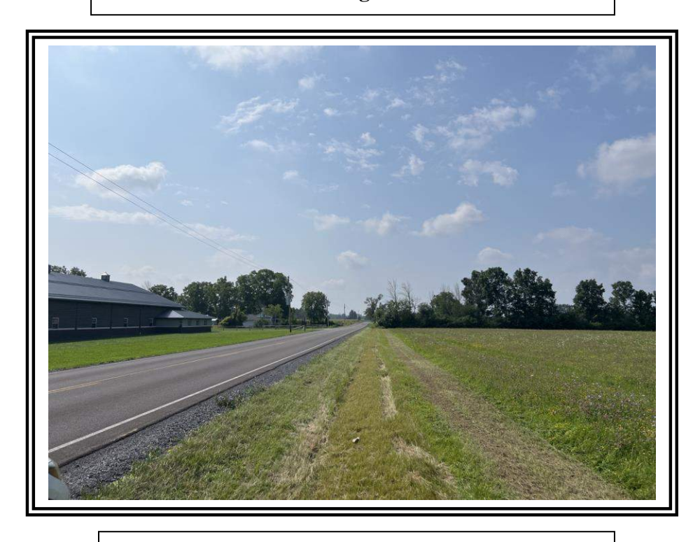
Entrance #8 – CR 107 Looking Right