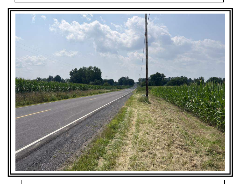
Entrance #4 – CR 108 Looking Right